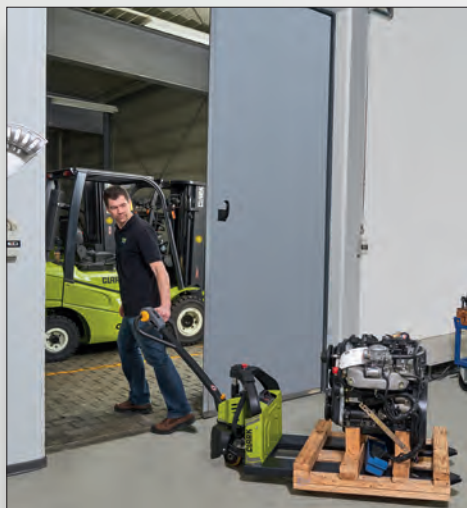
Ideal for use in industrial applications