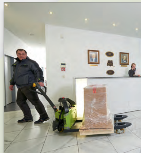
Ideal for use in logistics and retail